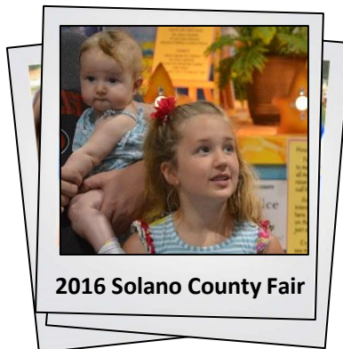
2016 Solano County Fair