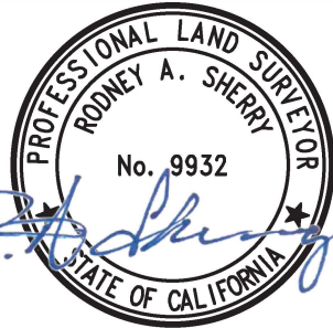
EXHIBIT B NEW PG&E EASEMENT 321 TUOLUMNE ST, VALLEJO, CA

CSA Cullen-Sherry & Associates, Inc. Civil Engineering - Surveying 1090 Adams Street, Suite A - P.O. Box 591 Benicia, California 94510 (707) 745-3219 Fax (707) 745-9436 CSA-ENGINEERS.COM