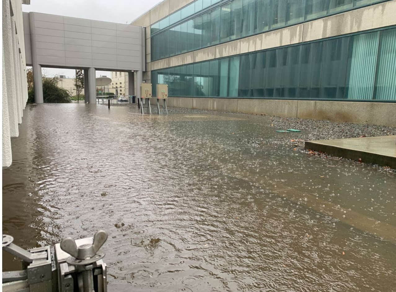
View of storm water at Hall of Justice and Law & Justice Center