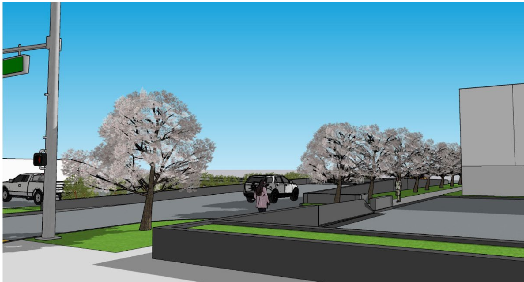
Concept View of ramp and low walls at Washington & Texas Street