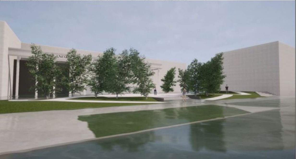
Concept Rendering of Court Entry with Raised Plaza