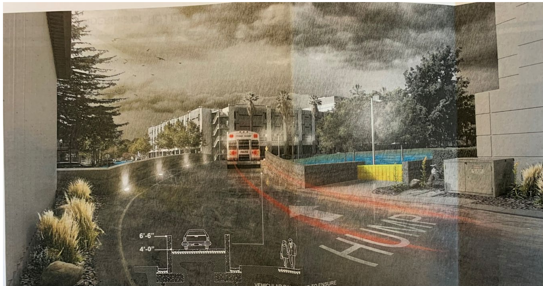
Concept View of ramp and low walls at Delaware Street (Adjacent to Justice Center Detention Facility)