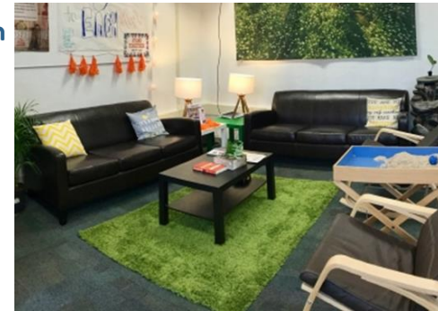
New Wellness Center

Goal: Coordinate and improve the health care delivery system by launching 5 new wellness centers on Adult Education campuses (planning & supplies).