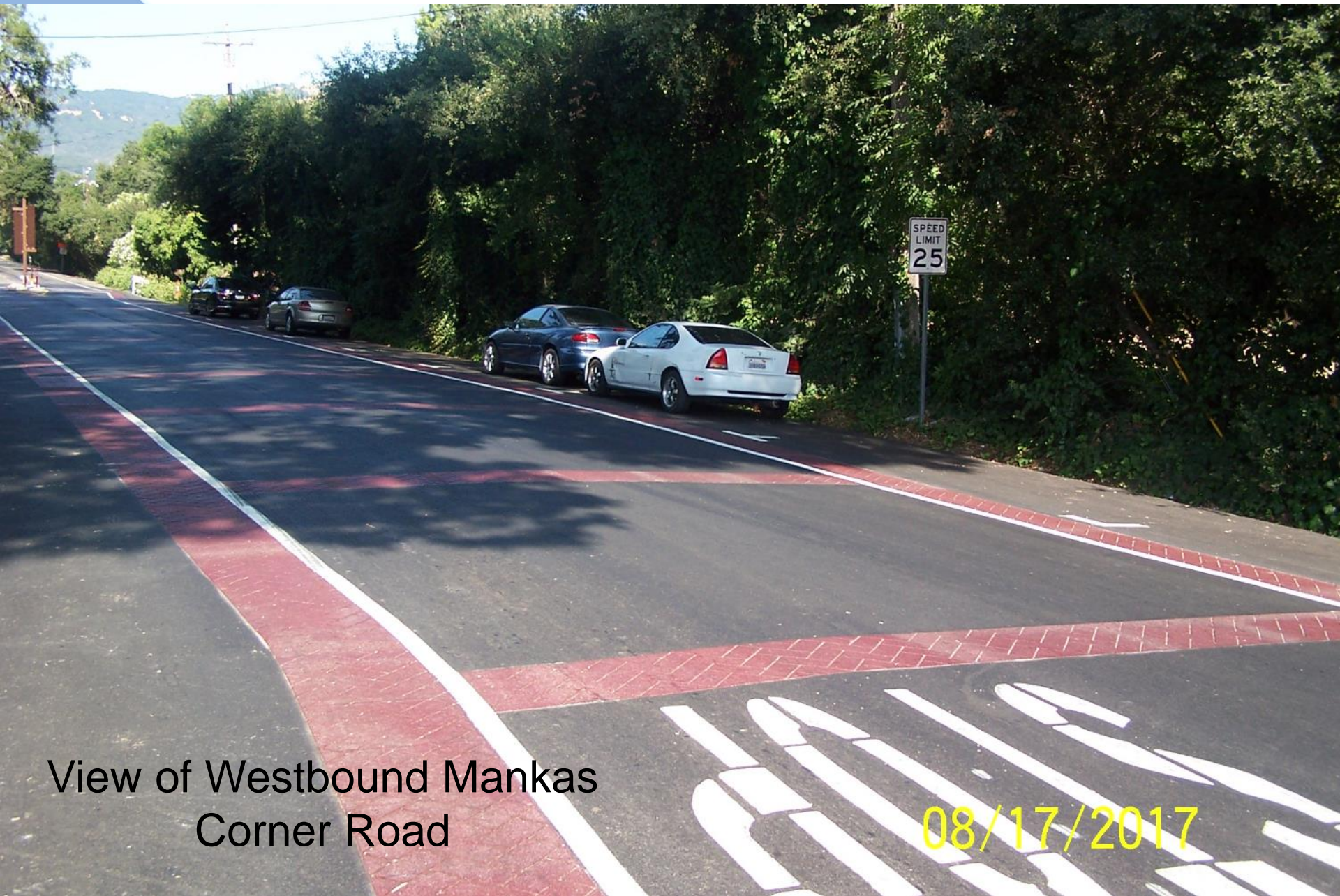
View of Westbound Mankas Corner Road