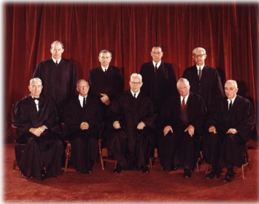
1963 Supreme Court

“...[I]n our adversary system of justice, any person haled into court, who is too poor to hire a lawyer, cannot be assured a fair trial unless counsel is provided for him. This seems to us to be an obvious truth.” Gideon v. Wainwright , 372 U.S. 335, 344 (1963)