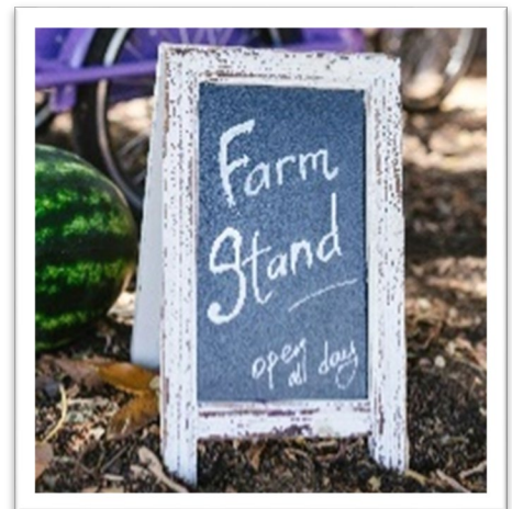
Table 5: Farm Stand Signs