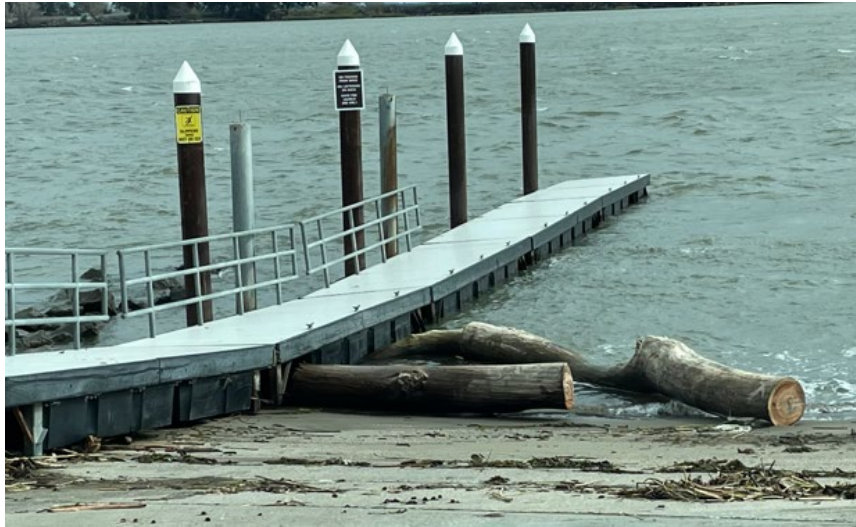
Figure 4 Dock Floats punctured by trees and debris washed ashore from the river