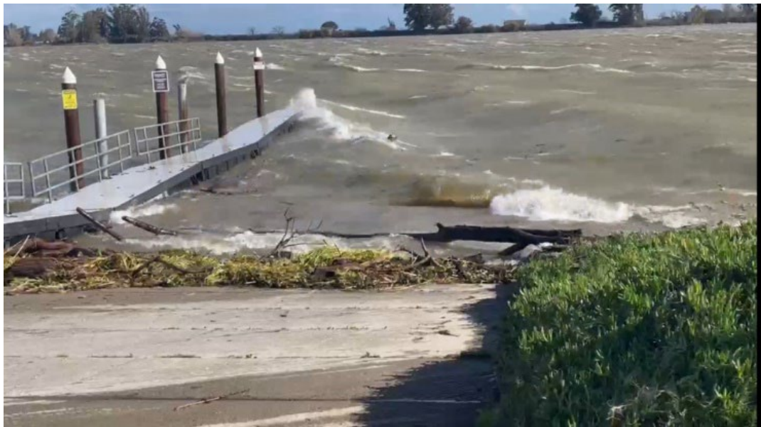
Figure 1 High winds from the southeast

Post storm activity inspections revealed significant damage to the boat launch float dock, including damage to one and complete destruction of another bracket securing the dock to two of the anchor pilings, and destruction of multiple deck boards and bumper rails, and float damage. Winds gusting over 40 mph from the south east created significant wave activity, depositing debris such as trees and logs from the river onto the launch and into the float dock infrastructure.