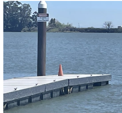
Figure 5/6 Punctured dock floats causing the dock to sag and lose buoyancy