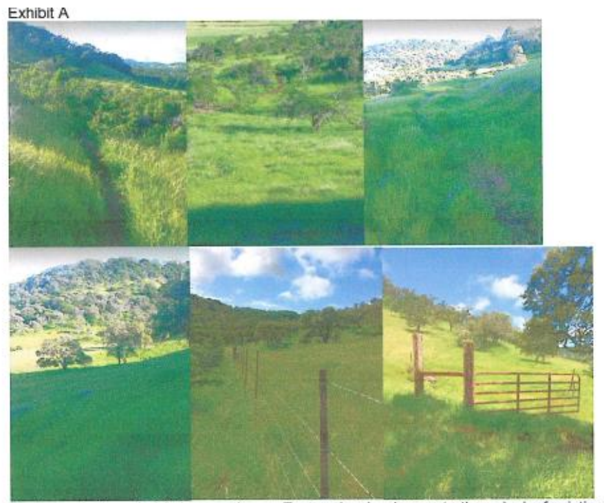
Photographs from behind properties on Eastern border demonstrating a lack of existing service roads and only the presence of cow paths