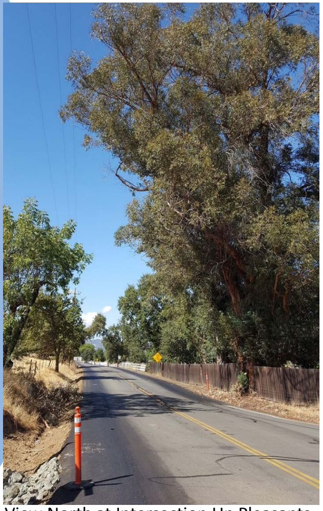
View North at Intersection Up Pleasants Valley Road