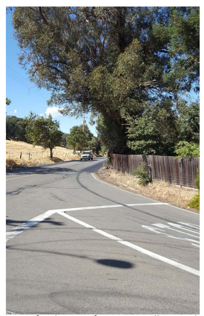
Line of Sight View from Vaca Valley Road at Intersection