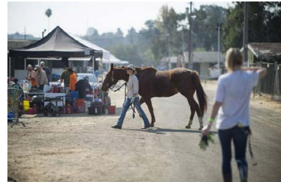
Solano360 and Fair Update