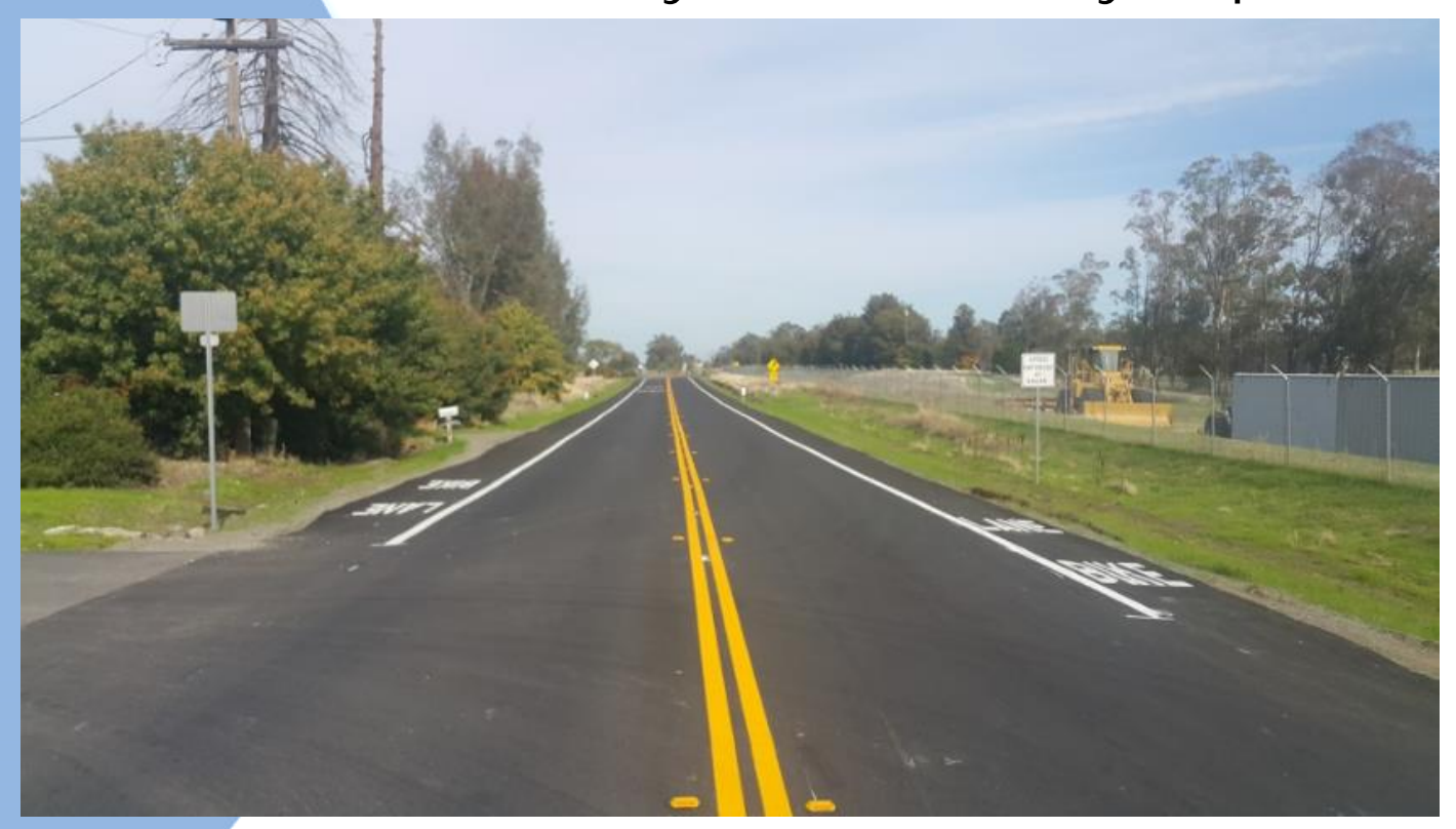
New Thermoplastic Striping