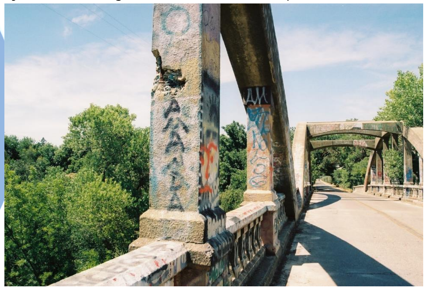
Stevenson Bridge, design in FY2018-19, construction starting in FY2019-20

Federally Funded Bridge rehabilitation and replacements remain a priority