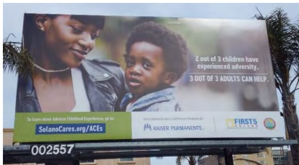
Vallejo billboard raising awareness of how to address Adverse Childhood Experiences.

trauma informed in a family centered way, as we build resilience and strengthen the family bond.