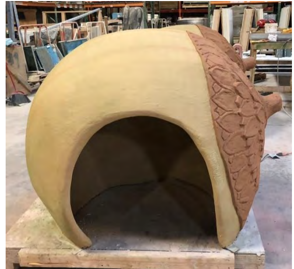
Bringing the spirit of “Doyuti T’uhkama” This acorn is getting ready for delivery to the Vallejo First 5 Center

Center staff and on-site partners will connect families to community resources such as health care, mental health services, job coaching, vocational training, childcare, early intervention services, CalWORKs, CalFresh, crisis response and domestic violence intervention, immigration services and other family supports. All programs and services will be