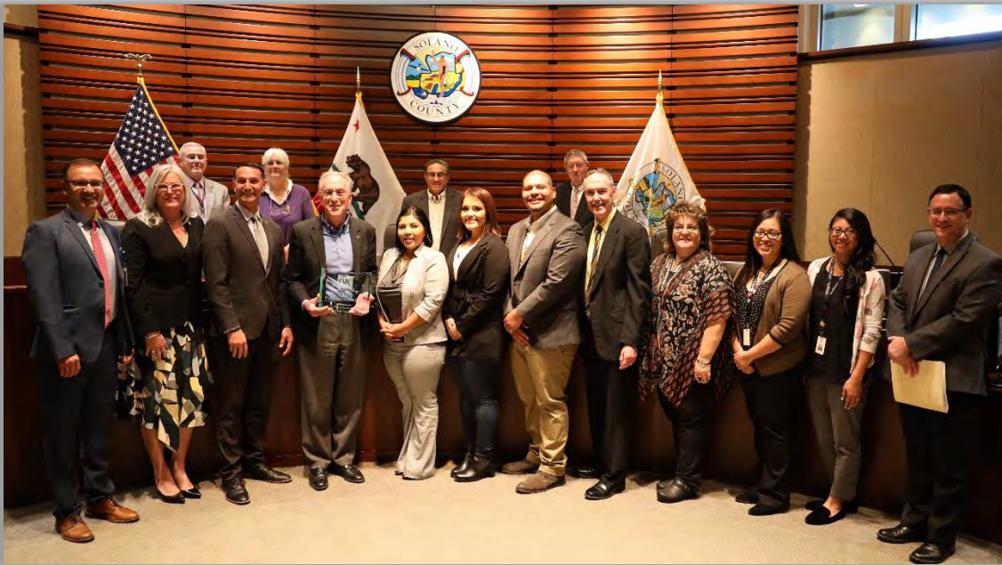
Solano County Board of Supervisors, Yocha Dehe Wintun Nation Tribal Members, Mobile Food Pharmacy representatives, and CSAC Executive Director after receiving CSAC Challenge Award.